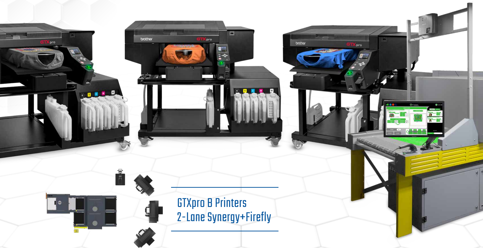
GTXpro B Printers 2-Lane Synergy+Firefly