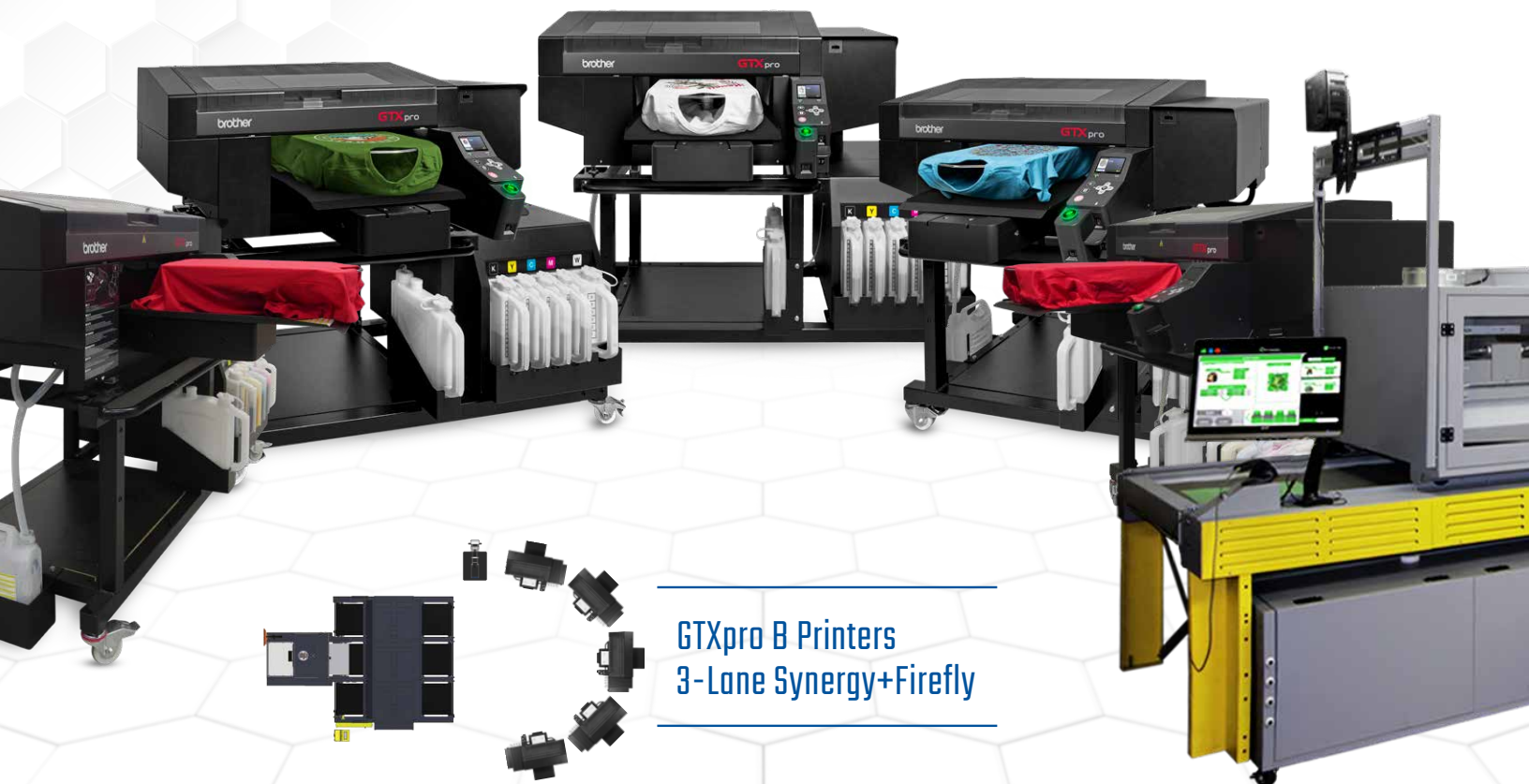
GTXpro B Printers 3-Lane Synergy+Firefly