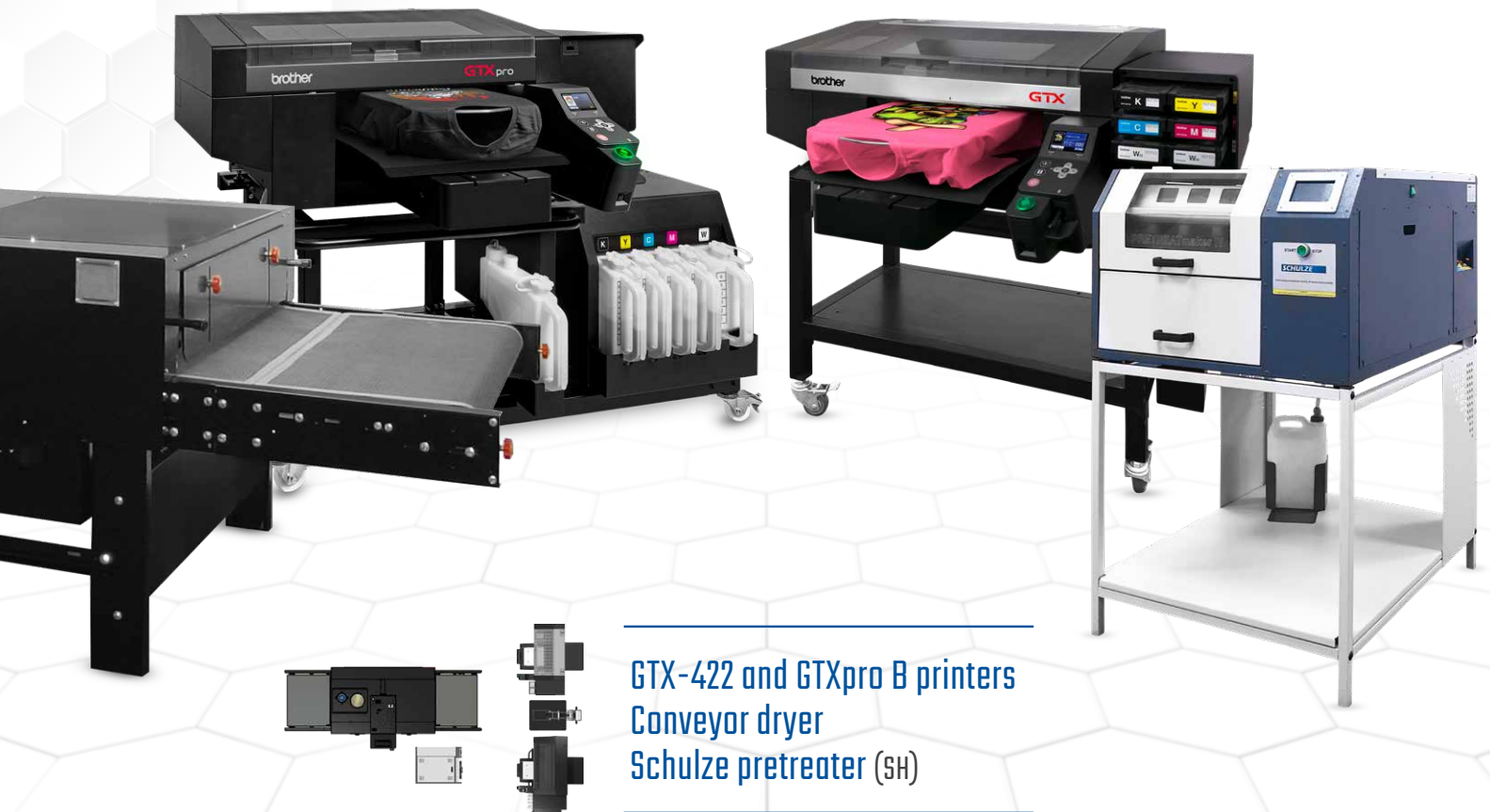
GTX-422 and GTXpro B printers Conveyor dryer Schulze pretreater (SH)