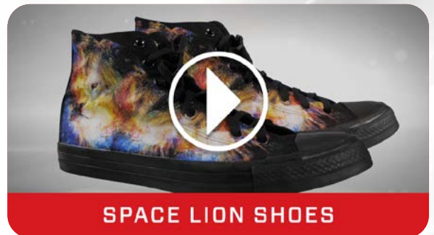
SPACE LION SHOES

Bring new solutions to your customers and help them make the most of their budgets. Show them creative new ways to customize their purchases. They'll love it and be more likely to show it off. You'll create a stronger connection between your product and your customer — and that often results in repeat sales.